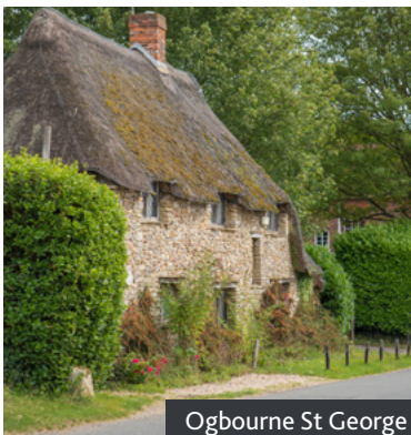
Ogbourne St George

After about five miles, stop at Barbury Iron Age hill fort - built in about 700BC, it is one of a string of earthworks along The Ridgeway. Continue walking, taking in tremendous panoramas from The Ridgeway's vantage point. It's a photo-op haven and a geologist's paradise - the chalk of the landscape started to form 100 million years ago. After roughly four miles (6.5km) turn off along a marked path to the beautiful village of Ogbourne St George.