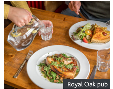
Royal Oak pub

Rejoin The Ridgeway and continue along the undulating trail - after about three miles you'll reach the Iron Age hill fort of Uffington Castle, and just beyond it the iconic landmark of the Uffington White Horse. No entry ticket is required; visitors freely wander around it. Why it was created remains a mystery although there's a theory that the image was supposed to be a dragon - this is upheld by the presence of Dragon Hill nearby, said to have been the place where St George killed the menacing beast of legend.