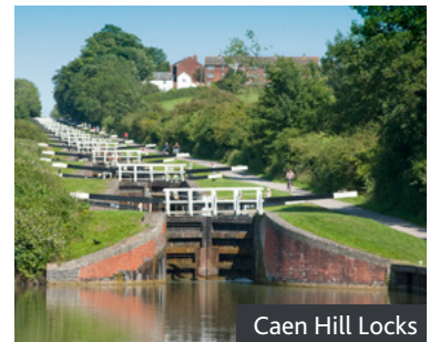
Caen Hill Locks

Continue hiking south, along fields and through the village of Bulkington then after Wick Bridge turn northward on the Mid Wilts Way and walk back up to the canal, passing through Seend Cleeve. The Great West Way area is abundantly endowed with walking routes. Quite apart from the trails used for centuries around Corsham and Devizes, the district is laced with ancient footpaths running between villages and towns.