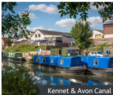
Kennet & Avon Canal

Stop for lunch at The Newbury, a lively gastropub in the town centre offering a lunchtime menu of salads, toasted sandwiches and more. Then drive about 20 minutes north to the village of Aldermaston, prettily lined with 17th and 18th-century workers' cottages. It's set on the Kennet & Avon Canal and from its once-industrial wharf you can take a leisurely stroll along the towpath - watching canal boats in spring and summer. Call in at the visitor centre and Canal Trust Cafe, set in a former canalman's cottage, which accepts pre-booked groups of up to 20.