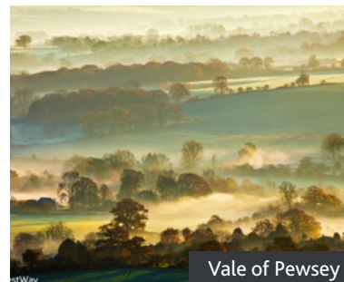
Vale of Pewsey

Calne is about a 35-minute drive west - a place of invention and discoveries - the English method of curing ham (known as the Wiltshire Cure) was developed here in the 18th century. If you've scope to make this a slightly longer break stay in a beautiful barn conversion at Buttle Farm for charcuterie tasting and tours of their rare breed pigs.