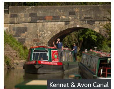
Kennet & Avon Canal