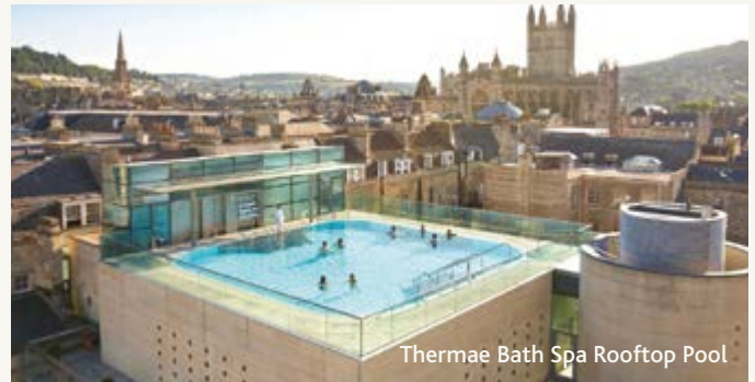
Thermae Bath Spa Rooftop Pool

experiences, including the beautiful Minerva Baths and Wellness Suite – and relax under the stars in the warm open-air Rooftop Pool, with a spectacular view of the city of Bath.