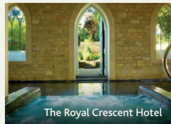
The Royal Crescent Hotel

Do you have clients that might like to explore the landscapes from the water. Add on a few days self-drive cruising or book a hotel boat. Boat hire is available on both the River Thames and Kennet & Avon Canal. And there is a choice of hotel boats on the Thames. Information on hiring a boat along England's Great West Way: GreatWestWay.co.uk/stay/boats