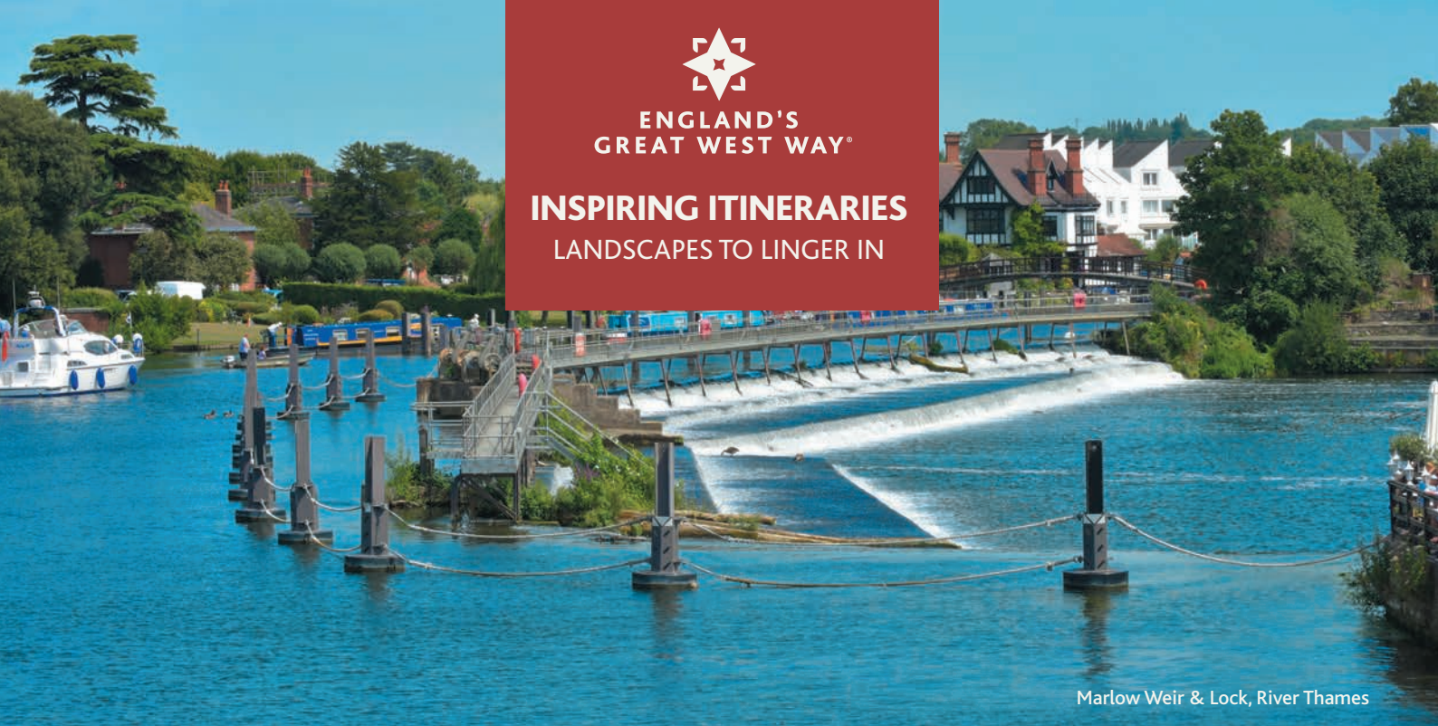
Marlow Weir & Lock, River Thames

Feel the ancient past reach out to you as you tread the Great West Way's glorious landscapes on this self-drive itinerary – a combination of walking exploration and guided tours.