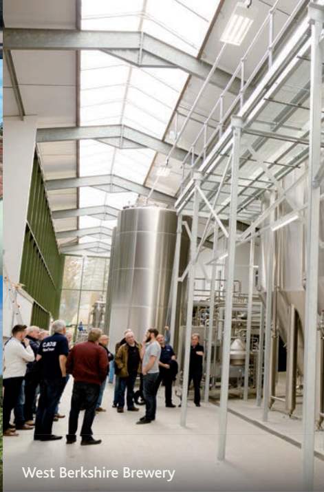
West Berkshire Brewery