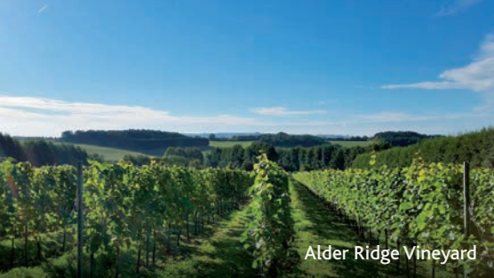
Alder Ridge Vineyard