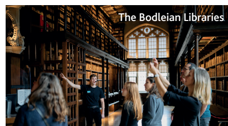
The Bodleian Libraries