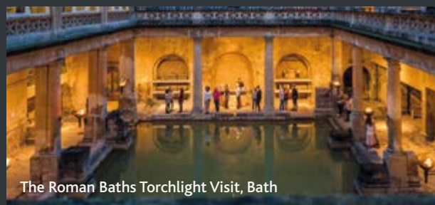
The Roman Baths Torchlight Visit, Bath

Visit in summer and take an evening tour at The Roman Baths with a torchlit visit and dinner package. Open until 10pm (mid-June to August), walk on 2,000 year-old pavements by the light of flickering torches and take in the magical atmosphere. Enjoy a glass of Prosecco in the pop-up bar or book dinner.