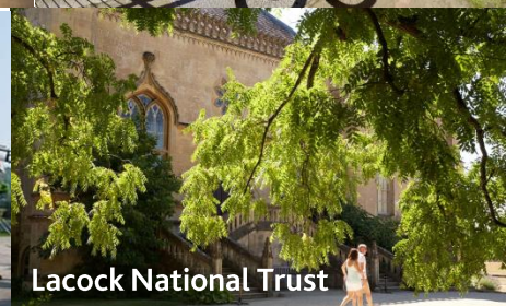
Lacock National Trust