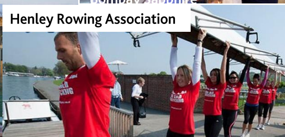
Henley Rowing Association