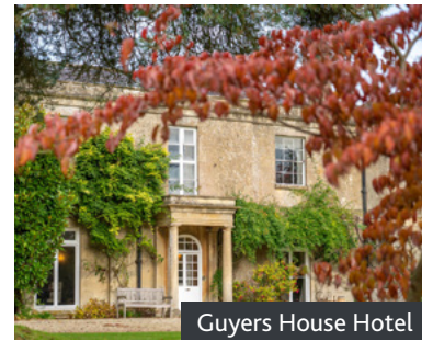
Guyers House Hotel

Overnight Guyers House Hotel or The Methuen Arms .