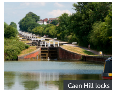
Caen Hill locks

End the walk at The Peppermill on St John Street for first-class British cuisine (there are six bedrooms here, should you wish to stay over).