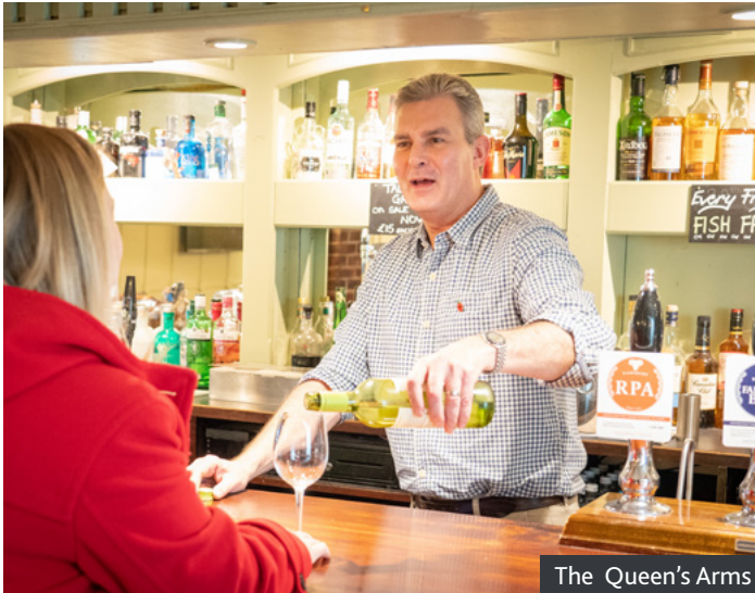
The Queen's Arms

Lambourn Valley is home to some of the finest race horse stable yards in England. For the best of starts, head to East Garston for breakfast at the The Queen's Arms - a terrific haunt of local horse enthusiasts where you'll get insight and atmosphere. Then drive to the village of Lambourn that's a nerve centre of race horse training and you'll see magnificent action along the gallops on the Lambourn Downs at the village fringes.