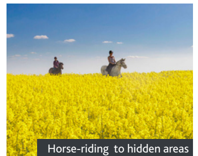
Horse-riding to hidden areas

The compelling equestrian chalk carvings on the hillsides are testament to this historic horse country whose expansive rolling landscape is one of the very best areas for horse enthusiasts in England.