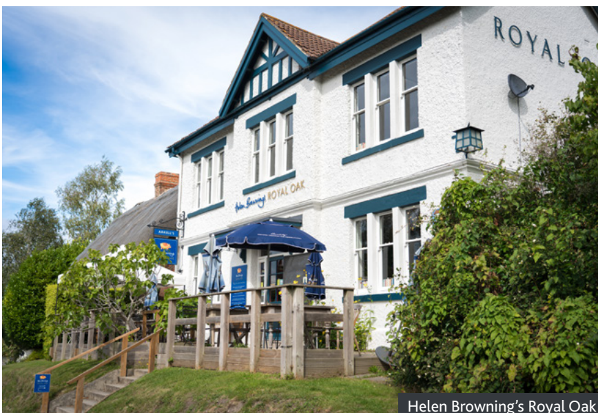
Helen Browning's Royal Oak

The order of experiences included in this itinerary is intended to be a guide only; you can choose to visit these wonderful experiences at your own pace and in your own way. Devising your own route is all part of discovering the Great West Way!