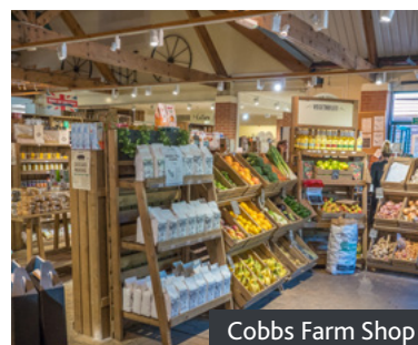
Cobbs Farm Shop

eggs, cereals, tea, smoked fish and meats, juices and biscuits. From Hungerford, you can travel along the canal on to Kintbury Bridge 75 from where you'll turn around and return to Devizes. Before you do, have lunch at the Dundas Arms – a wonderful riverside pub by the pretty village of Kintbury .