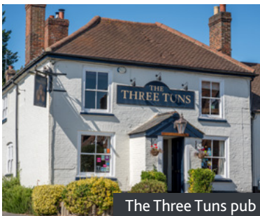
The Three Tuns pub

Further along the trail you come to Wilton Windmill , built in 1821, it is the only working windmill in Wessex. Just a few miles further along the canal is the Three Tuns Freehouse pub in Great Bedwyn.