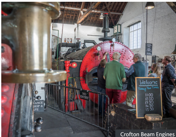
Crofton Beam Engines

Caen Hill is one of the greatest examples of canal engineering in England and is a great place to start your journey along this historic canal. Hire a boat at Devizes from the Kennet & Avon Canal Trust or from one of the many operators that are listed with the Canal and River Trust. Alternatively, you could start a little further east along the canal and hire a boat with Honey Street Boats and on your return from Kintbury you could do an extra leg to Devizes and then back to Honey Street. This round trip is about 55 miles and includes 56 locks and you could easily do it all in a week.